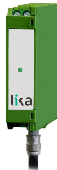
IF60 - IF61