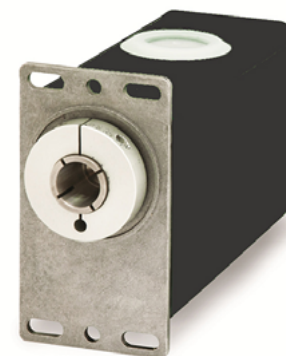
RD5 - RD53